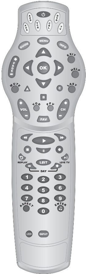
© 2004 ICX Global, Inc. All rights reserved. Part Number ICX18345, version 1.0 07012004

VISIT US ON THE WEB YOU CAN FIND PROGRAMMING INSTRUCTIONS AND CODES FOR ALL OF OUR REMOTE CONTROLS, AS WELL AS INFORMATION ABOUT OUR OTHER PRODUCTS ON OUR WEBSITE: www.icxglobal.com